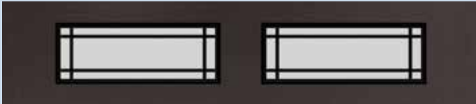
Regal Wide Black Muntin Bars