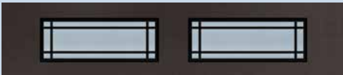
Satin Texture Glass & Regal Wide Black Muntin Bars