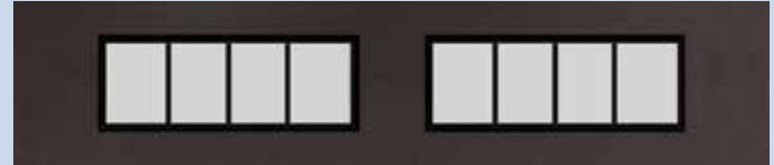
Provincial Wide Black Muntin Bars