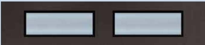
Satin Texture Sealed Glass